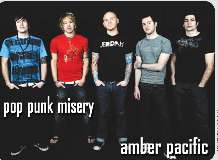
pop punk misery